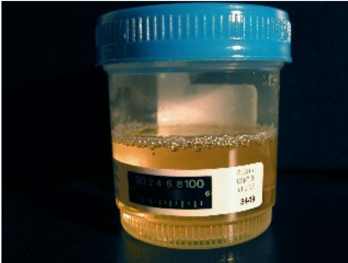
(1) Collect Specimen