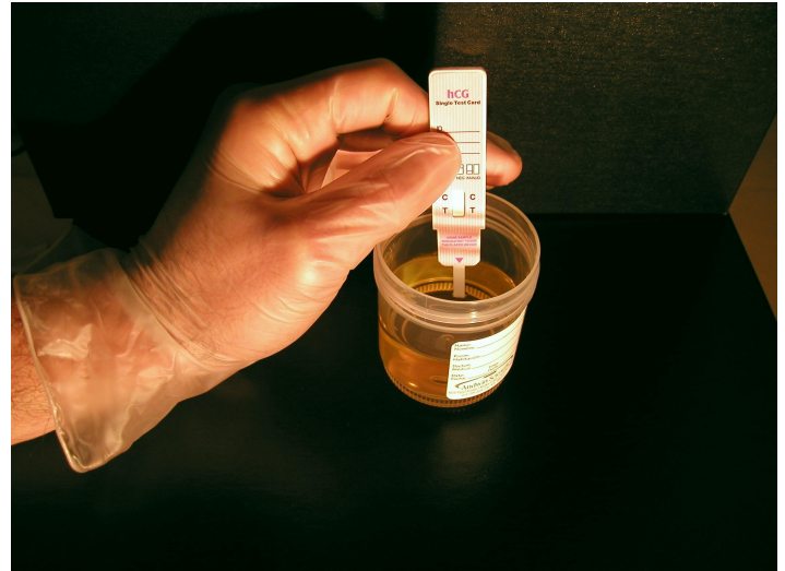
(2) Remove Cap & Dip Test Strips for 30 Seconds