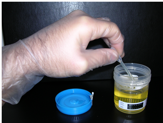
(2) Remove Cap & Collect Specimen with Pipette