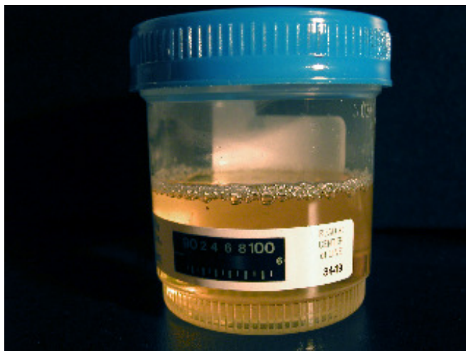
(1) Collect Specimen